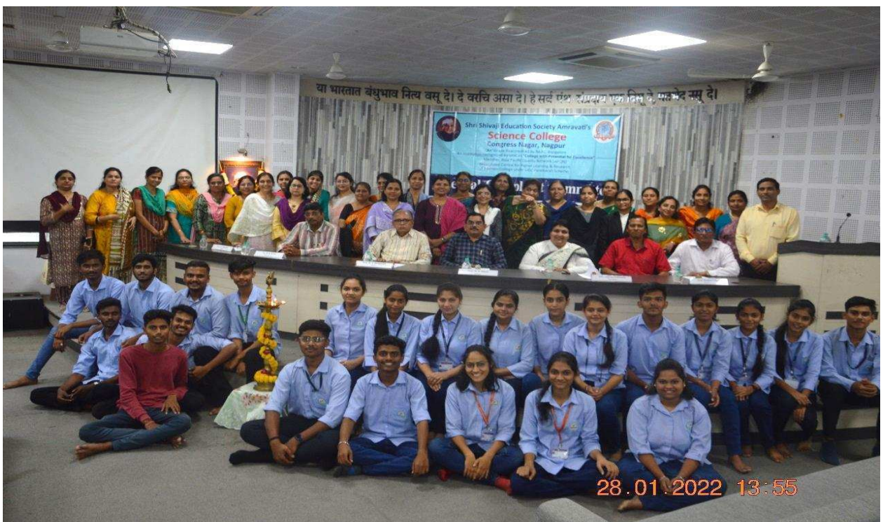
Group photo of the guest lecture organized by ICC entitled, "Laws regulating women safety at workplace (Act-2013)".