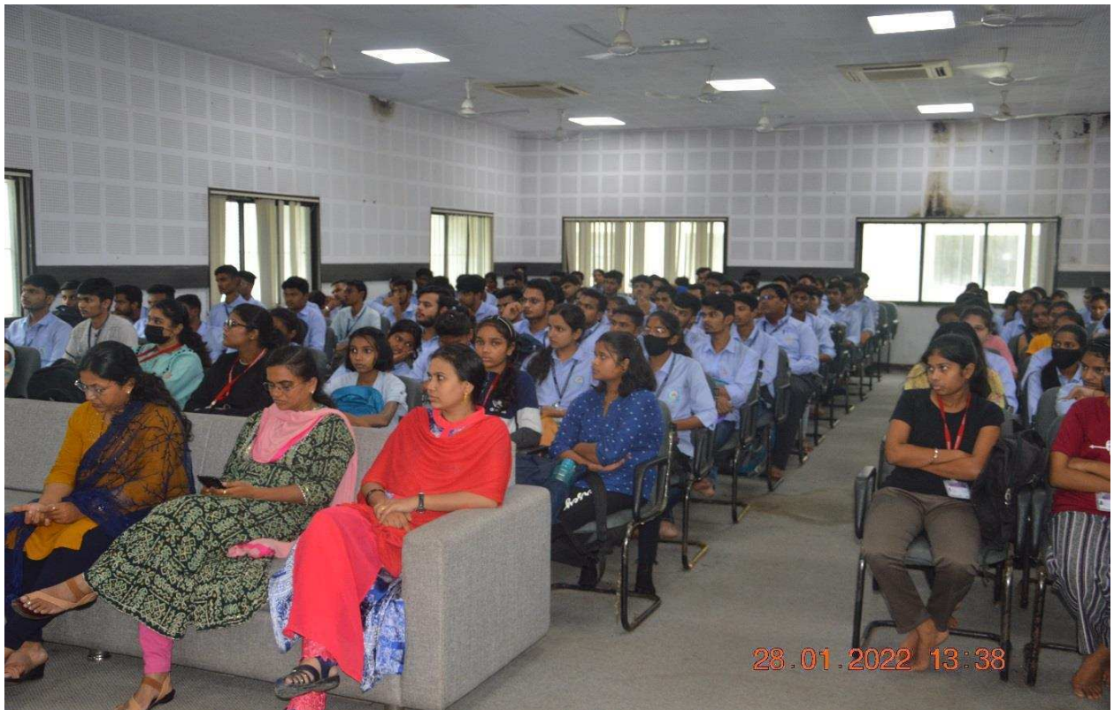
Attendees of the guest lecture organized by ICC entitled, "Laws regulating women safety at workplace (Act-2013)".