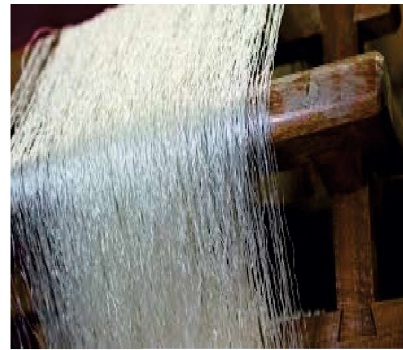
Fig.6 Weaving [6]