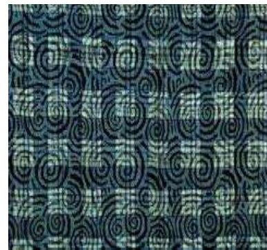
Fig.7 Printing [7]