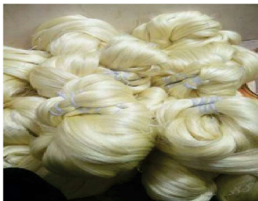
Fig.5 Twisting [5]