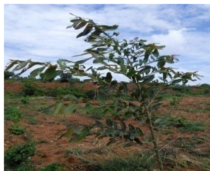
Fig.1 Tassar plant cultivation[1]