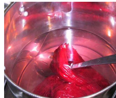
Fig.8 Dyeing [8]

The larvae hatch from the eggs and feeds on the food plants. They undergo various developmental stages from Ist Instar larvae to V th Instar larvae. After this the V th instar larvae starts oozing out a secretion from the mouth of the silkworm called as spinneret. After coming in contact with surrounding environment the