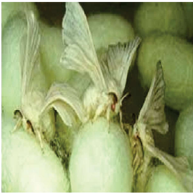
Fig.3 Egg production in grainages [3] (Krushidhan Biotech, Kolhapur, Maharashtra, India, Silkworm Seeds)